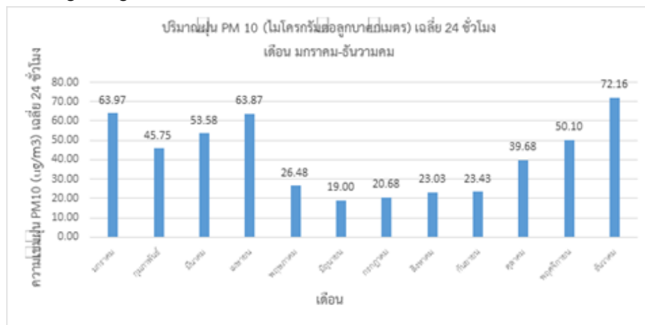
Fig.3 PM 10 concentration in 12 months at Phitsanulok site

The PM 10 concentration of Phitsanulok samples that measured during year 2022, total of 12 months, the data was collected through the Air Quality and Noise Management, website of the Pollution Control Department of Thailand. The PM 10 concentration data was recorded as 24 hours. From the study, the results can be summarized in figure 3. The highest of data is 72.16 µg/m 3 in December of year 2022. PM 10 samples was not higher than the Thai Ambient Air Quality Standard (NAAQS) 120 µg/m 3 . The study found that the main sources of dust were from burning for agriculture. and the occurrence of forest fires.