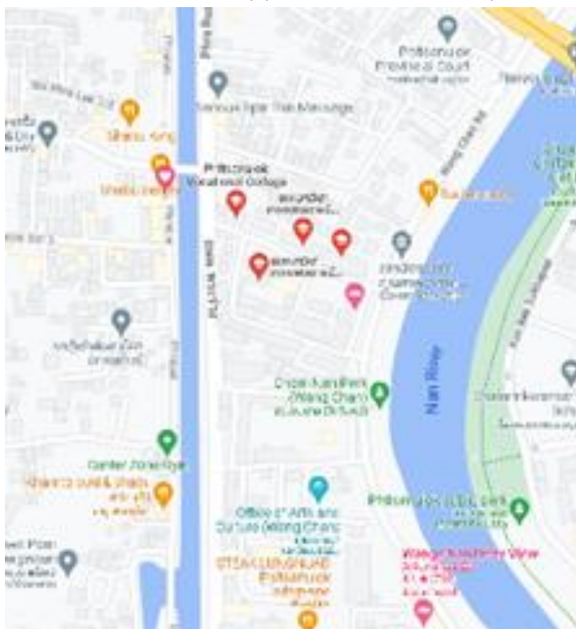
Fig. 1 Maps of Thailand and Phitsanulok sampling site

The dust samples were collected 365 samples in a year in the Phitsanulok municipality area of Phitsanulok province. Map in figure 1 showed the area of Suan Chom Nan In front of Phitsanulok College. The duration of sampling the project was determined from 1 January year 2022 to 31 December year 2022.