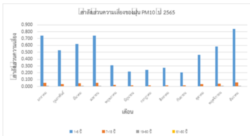
Fig.5 The HQ of PM 10 in 12 months

From the HQ evaluation, it was found that the value was in the range of 0.0011 - 0.8368, which was less than 1, meaning that people living in the Suan Chom Nan in front of Phitsanulok college. There is no risk from exposure to PM 10 dust, so it does not affect health. However, the Nan viewing area. It is a public area and next to the road for traffic. People used Suan Chom Nan and exposure dust throughout the day. The PM 10 dust concentration does not exceed the national standard. People in the area of Suan Chom Nan must therefore be no danger. (Figure5)